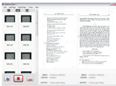
(Screenshot of main window)