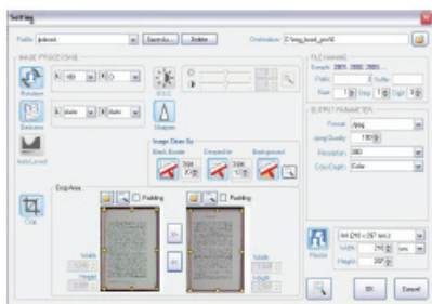
(Screenshot of setting window)