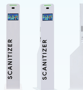
Scanitizer Plus Hi-Performance